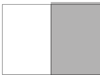
Full page advert